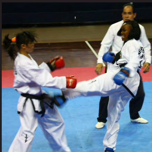
Vietnam vs Jamaica in the Women's team sparring

Welcome to the first issue of a regular 2011 ITF World Championships newsletter that will provide information and updates. The tournament will be in the capital city of New Zealand, Wellington from 9-13 March 2011. New Zealand is proud to have this opportunity, and invite you to join us whilst we showcase our nation and rich culture to the world.