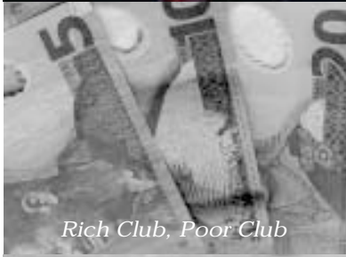
Rich Club, Poor Club