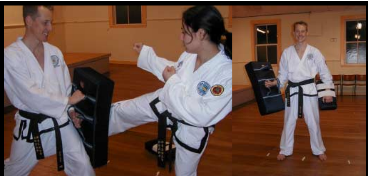
Large Focus Pads $115