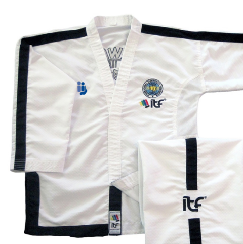
Black Belt Do Bok 4th -6 Dan (International instructor)