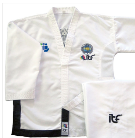
Black Belt Do Bok 1st – 3rd Dan