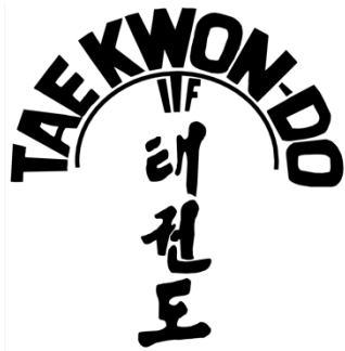
Official ITKD Symbol (Rear of dobok)