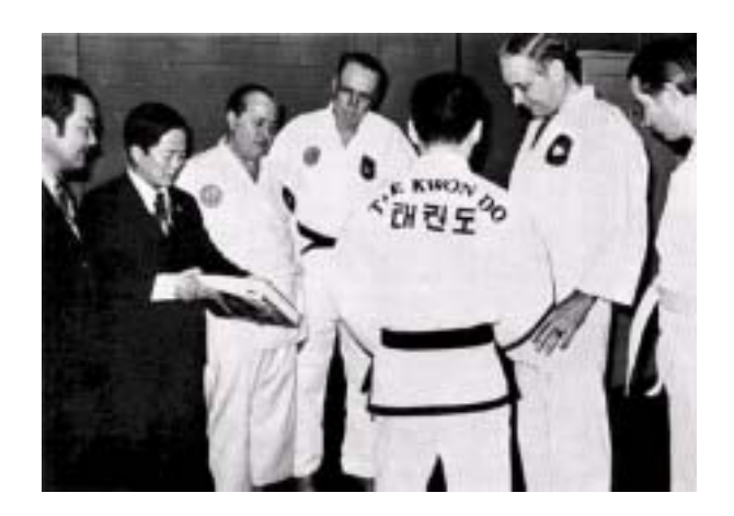
General Choi explaining the philosophy of Taekwon-Do to United States Senators and Congressmen

General Choi in the condensed encyclopaedia remarks that (in the world today) there is the tendency of "the stronger preying upon the weaker". The use of Taekwon-Do for selfish, aggressive or violent purposes is strictly forbidden. Continual harassment, invasion and occupation of Korea and its ancient kingdoms have probably contributed to this belief. General Choi states the utmost purpose of Taekwon-Do to eliminate fighting by discouraging the stronger's oppression of the weaker with a power that must be based on humanity, justice, morality, wisdom and faith, thus helping to build a more peaceful world. This is indeed reflected by the Student Oath, particularly the last two articles: