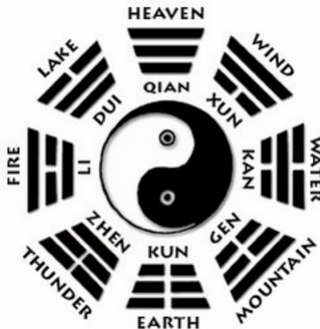
Tai Chi symbol and Eight trigrams

This symbol represents the perfection of balance and harmony, and the creative union of opposites throughout the universe.