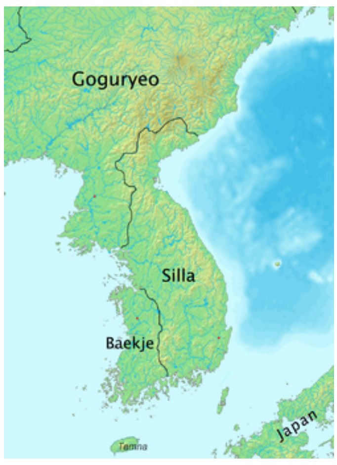
Silla at its height in 576A.D..

It began as a chiefdom in the Samhan , an ancient confederacy of Mahan, Jinhan, and Byeonhan in the central and southern Korean peninsula, which is thought to have formed around the time of the fall of Gojoseon. Becoming Silla in the Three Kingdoms of Korea, it later allied with China, and eventually conquered the other two kingdoms - Baekje in 660A.D. and Koguryeo in 668A.D.. Thereafter, Unified Silla or Later Silla as it is often referred to, occupied most of the Korean Peninsula, while the northern part re-emerged as Parhae (698 A.D.–926A.D.), which was considered the successor state to Koguryŏ. After nearly 1000 years of rule, Silla fragmented into the brief Later Three Kingdoms, handing over power to its successor dynasty Koryo in 935A.D..