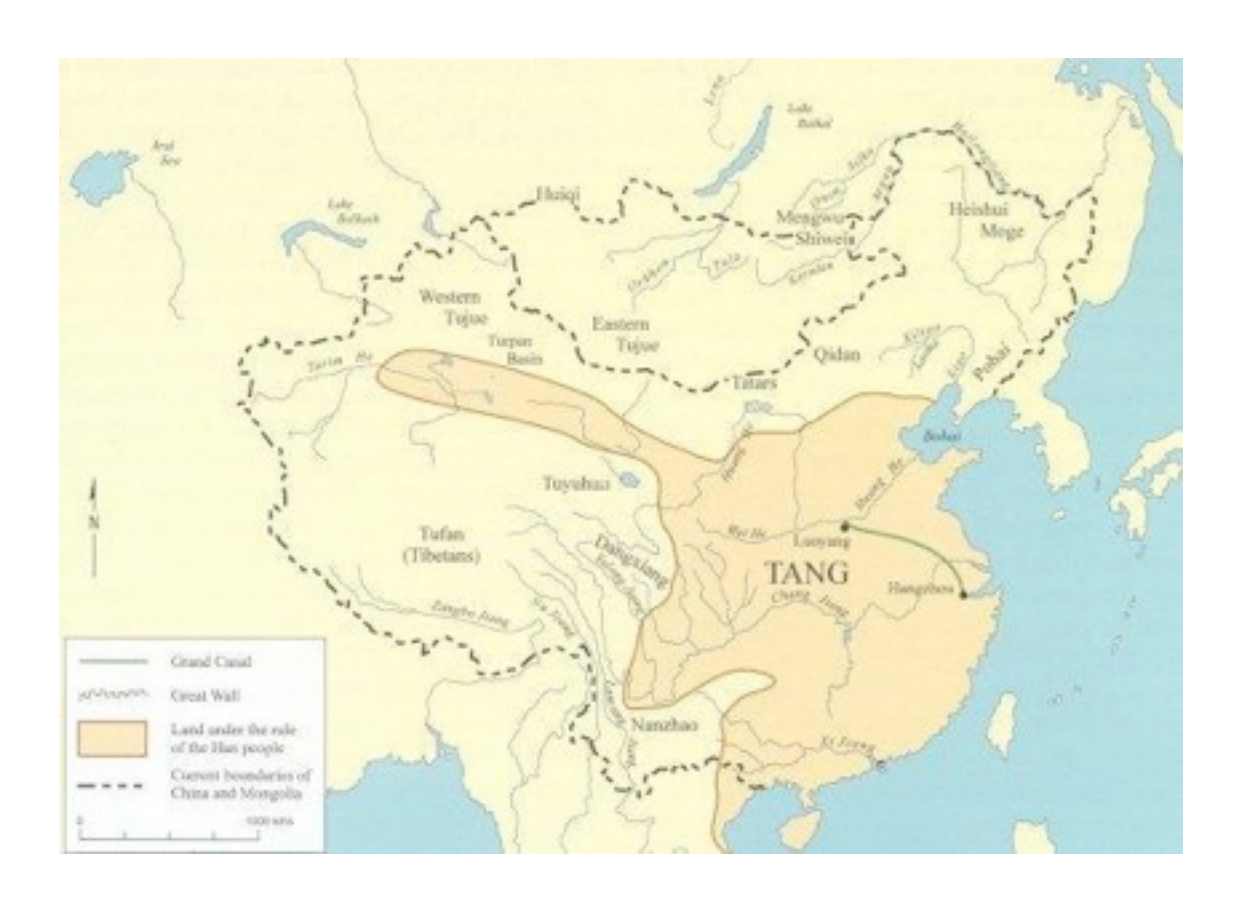
China at Tang Dynasty with location of Grand Canal

[Note: inconsistency: should read Sui dynasty, Tang came to power in 618A.D. part as result of Sui's massive losses in the Koguryo-Sui Wars]