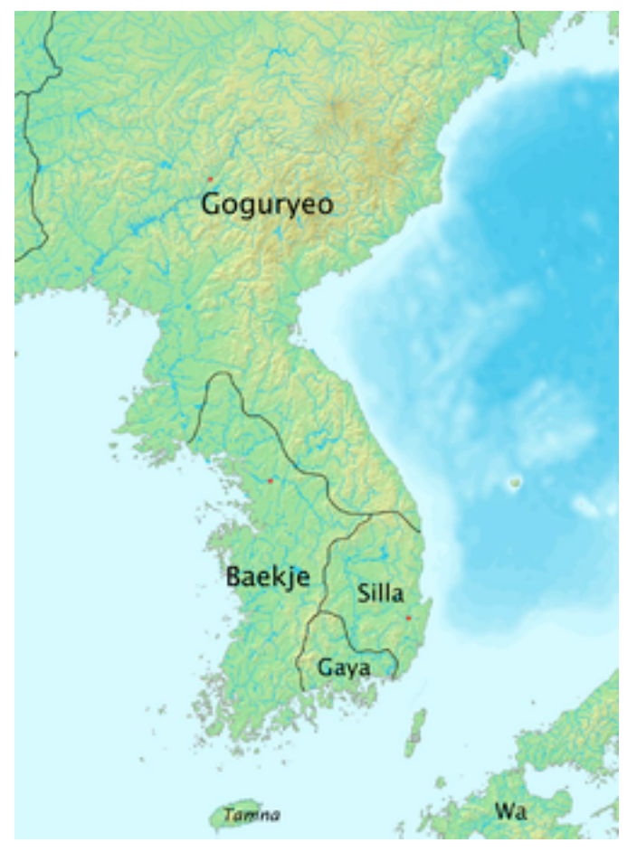
Baekje at its height in 375A.D..

According to the Samguk Sagi (the oldest surviving Korean history book, written in the 12th century A.D.), Onjo, the son of Koguryo's founder Jumong, founded the nation of Baekje in 18 B.C. with the early capital of Wiryeseongn in the modern-day Seoul area.