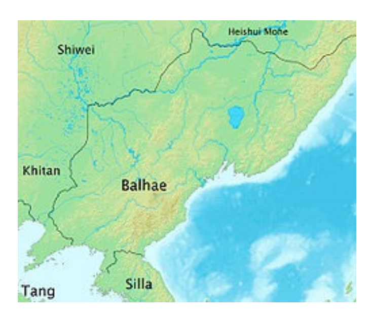
Parhae at its greatest territorial extent

Although Silla did contribute to bring down Koguryeo, it was Tang Dynasty China who took control over most of former Koguryo's territory. Also, refugees of Koguryo founded Parhae state ("Balhae" or "Bohai" in Chinese) (698–926A.D.) a few years later in Manchuria. After Parhae's collapse its territory was controlled by the northern nomadic people and was thus no more part of Korean history.