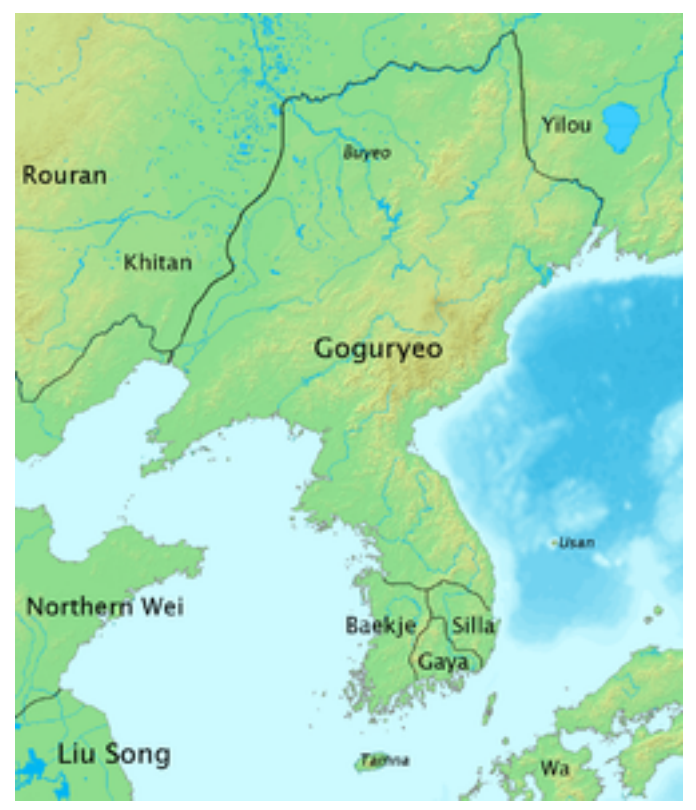
Koguryeo at its height in 476 A.D..

The English word "Korea" derives from "Koryo", which in turn was named after Koguryo.